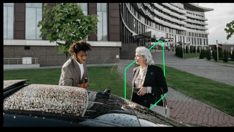
People Management Manage your traveller profiles in real-time with PRISM's personalised user experience, including a new and improved onboarding flow.

Optimise your travel programme with PRISM's comprehensive and agile travel management features, including an easy to use travel policy builder to ensure seamless compliance and passenger satisfaction.