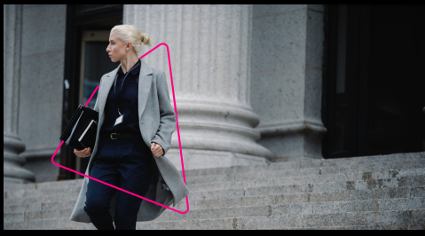
Account Management PRISM's integrated live customer service and resolution hub allows for easily accessible support from Addison Lee's dedicated Client Services teams.